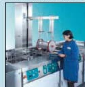
Optimum Console with Rigibot CTS-1000 Transport and RoTumbler Rotating Basket System.