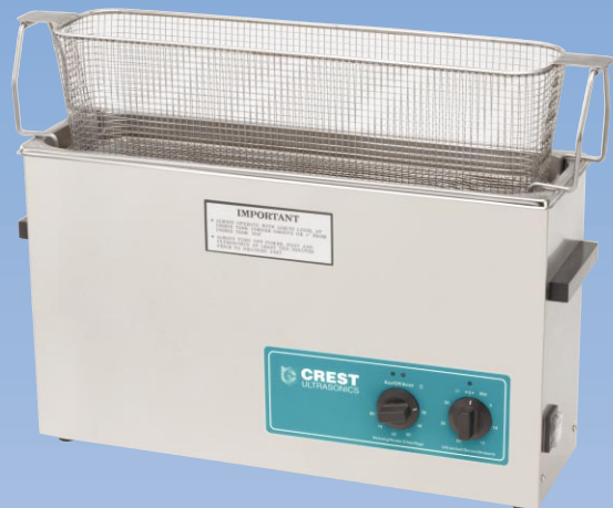
CP 1200 HT with SSMB 1200-DH Mesh Basket with Drain Positioning Handles

* Digital controls not available with CP 200 model